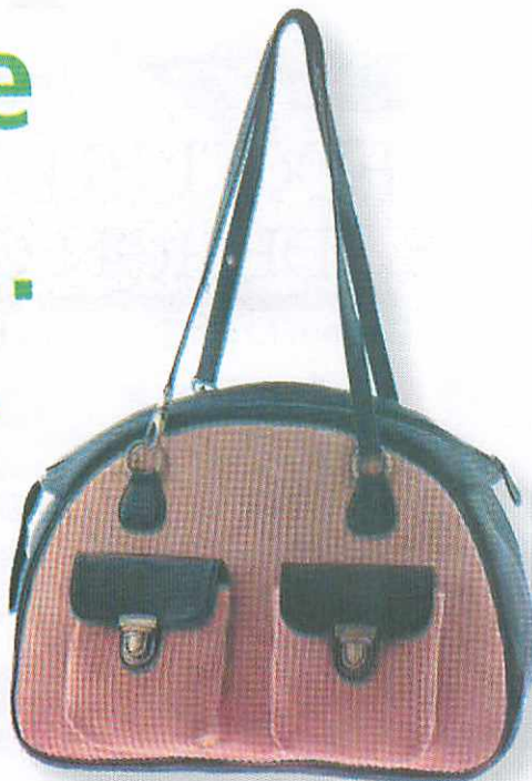
Her magazine photo